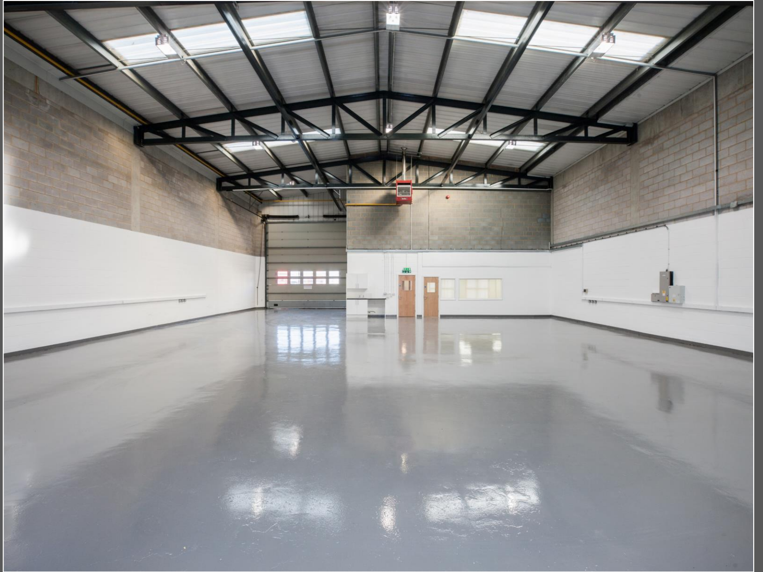
Indicative Images – Refurbishment of Unit 2 The Quadrangle